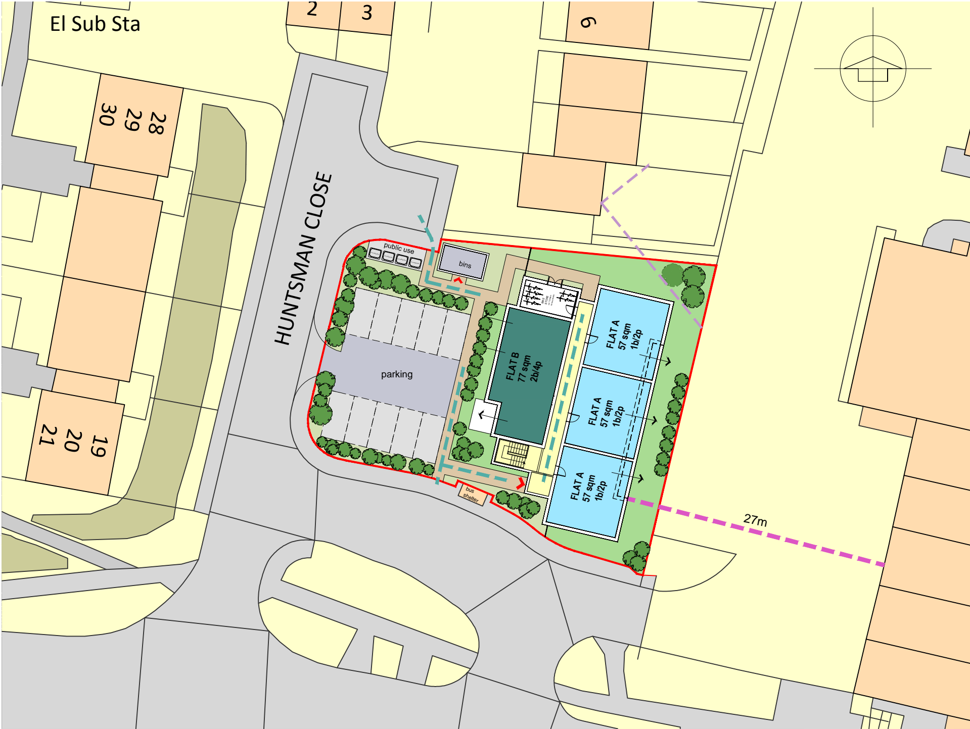
SITE PLAN - GROUND - AS PROPOSED

NOTES: This drawing has been prepared for the purposes of concept and design development and is not to be used for any other purpose. Dimensions are indicative and should be referenced against measured surveys only. This drawing is the property of Martin Ralph and must not be reproduced, in part or whole, or deviated from, without their permission.